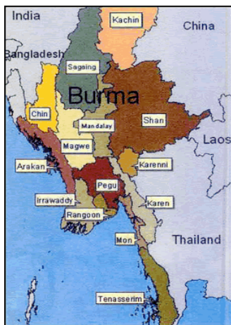
Map of Myanmar